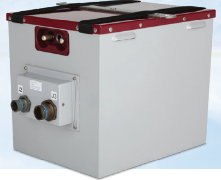
RG-390E/KH-4 (RG-390E/KH assembled with HCU-4)