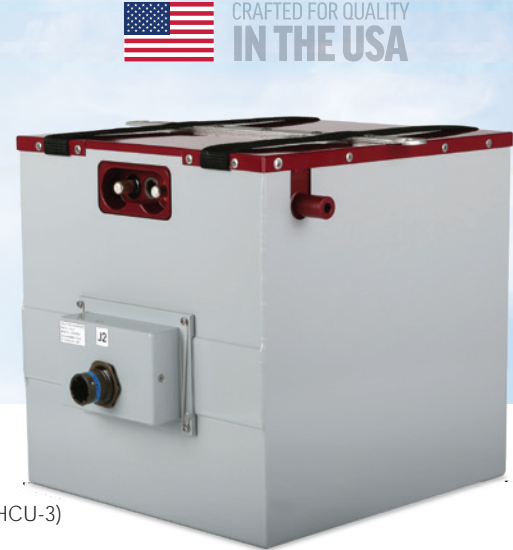
RG-380E/60LH-3 (RG-380E/60LH assembled with HCU-3)