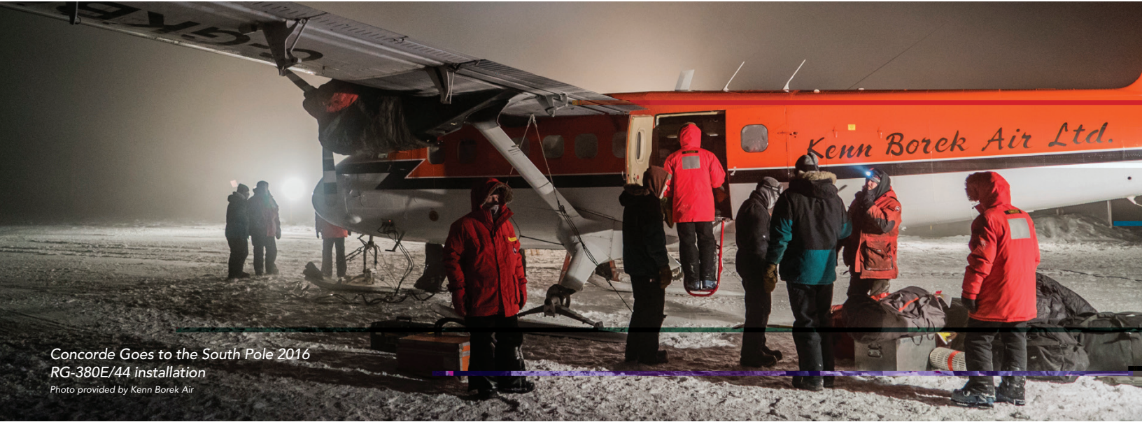
Concorde Goes to the South Pole 2016 RG-380E/44 installation