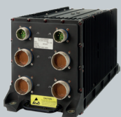
Dual Channel Digital Autopilot