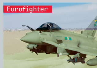
Single Channel Flight Control Computer