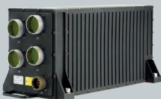
High Integrity Flight Control Computer