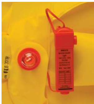
VEST LOCATOR LIGHT & WATER-ACTIVATED BATTERY