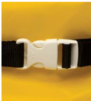
ADJUSTABLE WAIST STRAP