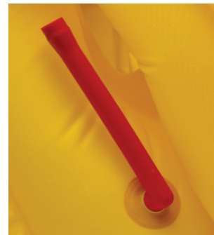
ORAL INFLATION TUBE