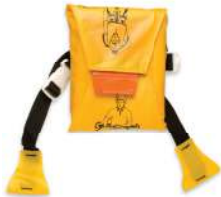
Constant Wear Pouch