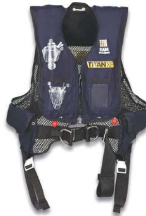
Exterior Vest Cover