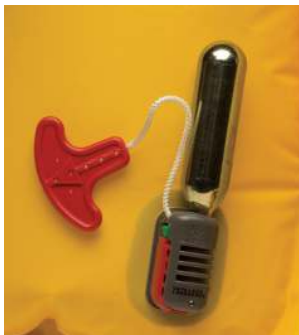
CO 2 INFLATION CYLINDER